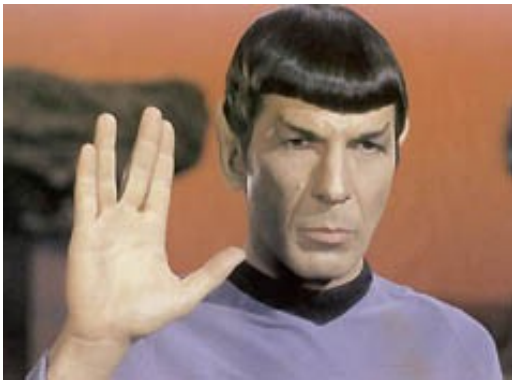
Dr. Spock Time warp, other stuff