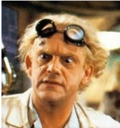
Doc Brown Flux Capacitor